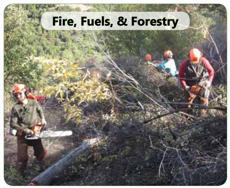
Fuels reduction crew working in the Bear Country area

In 2018, the Fire, Fuels, & Forestry Program focused on the implementation of its four fuels reduction projects in the watershed. We completed the transition to using contract crews as our local workforce has significantly decreased in size and costs have risen. With this change, our costs decreased significantly and we were able to complete additional on-the-ground work.