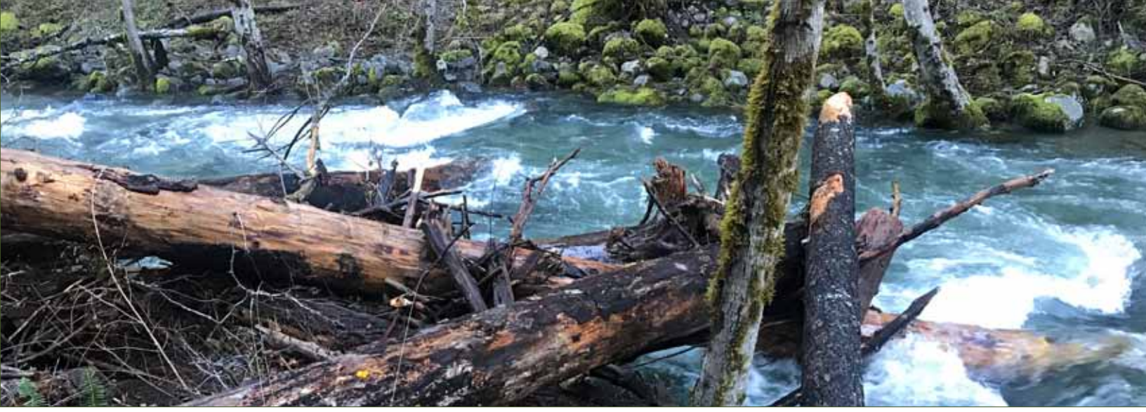
Large wood structures placed in Methodist Creek in 2017 are catching wood for future fish habitat