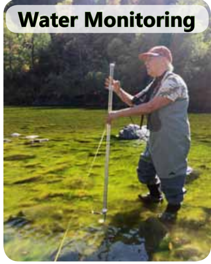
Late summer algae bloom monitoring

As SRRC's Habitat Restoration Program grows our monitoring program is increasing in scope and scale to monitor these projects from design through implementation and beyond. Each project location has different goals so the data gathered is site specific. This data provides support for hydraulic modeling efforts by using field observations and pictures to document changing river conditions. Floodplains and river channels are being analyzed for potential cold water refugia with an emphasis on locating potential year-round rearing habitat. Strategically placed wells monitor groundwater levels, temperature and dissolved oxygen at potential restoration sites. Survey posts in floodplain areas are also used to topographically reference the river levels at varying water stages.