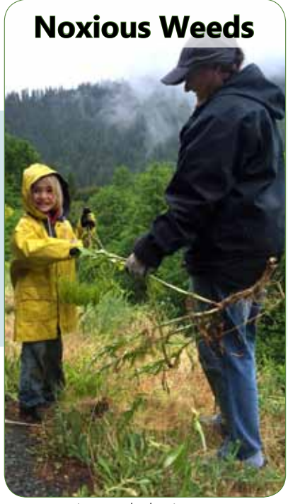
we start our weeds volunteers young!

Populations of Italian thistle around Forks of Salmon have been declining thanks in large part to our youngest volunteers. Elementary students, community members, and the crew scaled to great heights to help bring Italian thistle down 40% from the previous season. Our volunteers have been integral in treating oblong spurge as well, a species we have a good chance of eradicating. As for new arrivals on the scene we are still keeping an eye on sulfur cinquefoil, treating satellite populations, and documenting its extent with the help of the US Forest Service. In response to the Wallow Fire in August of 2017, we were a part of the Burn Area Emergency Response effort. While native vegetation in the watershed is well adapted to fire, many noxious weed species thrive Community weeds day in Sawyers Bar; in disturbed soil. Our surveys focused on roadways, trails, and fire lines where we were concerned about the potential for the spread of vigorous invaders.