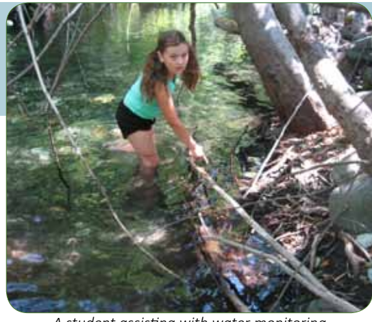
A student assisting with water monitoring

The Watershed Education Program was funded by the Ford Family Foundation and US Fish & Wildlife Service, and would not have been nearly as fun or educational without the assistance of the Karuk Tribe, MKWC, and numerous community volunteers.